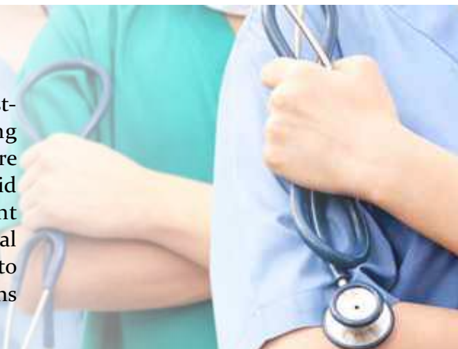
Rapid Job Growth Means Competition for Clinicians in Fast-Growing Industries

Nursing has long ranked among one of the fastest-growing industries across the globe, employing millions. Nurses are the keystone of the healthcare industry. The nursing industry is changing at a rapid rate. With shifting technology, an aging patient population and new challenges brought on by federal legislation, the nursing industry is being forced to evolve to ensure that hospitals and other organizations are able to continue to provide the best possible care.